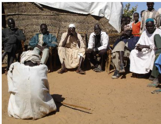
Mediation is just one out of several tools for conflict resolution. There might exist traditional methods as well.

How can I support this efforts on the field level?